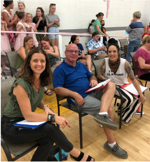
Albertville Sings -Judges