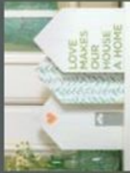
Samples of Finished Project