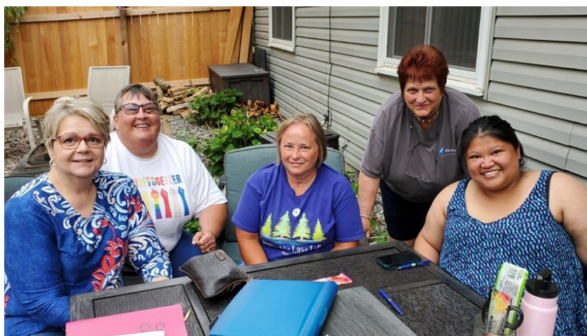
Living and Learning Social